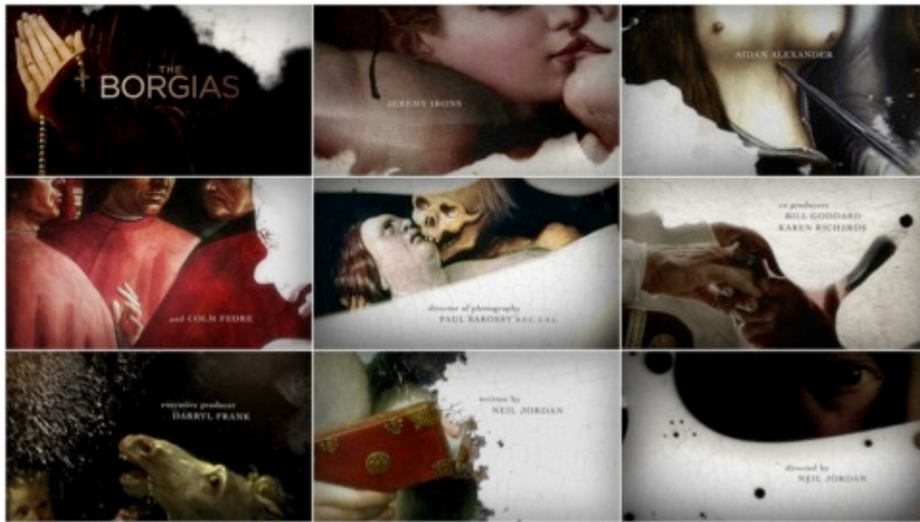
The Borgias credits

Borgia family, deals with corruption, lust, bribery and murder. 57