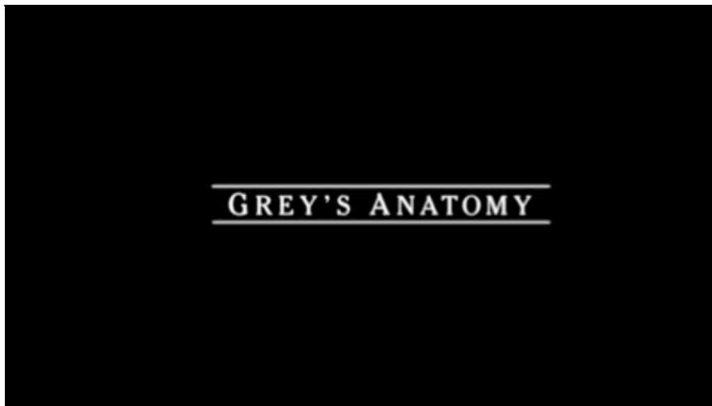
Grey's Anatomy credits

Commenting on this disappearance, Ellis compares quality openers to the “hardback binding on a book, denoting quality, seriousness of intent and the buyer’s willingness to pay more”. 50 His reading highlights that credits sit at the heart of a reconfiguration of entertainment standards, where “quality” and “sophistication” work to alleviate the effects of a new economy of scarcity while simultaneously setting up cultural hierarchies. The effect of these changes is that the kind of imaginative openers praised by critics is quickly becoming an exclusive staple of premium channels. While economic needs and the pressures of advertisers are forcing the national networks to maximise on revenue and cut on interstitials, platforms like Showtime, FX and HBO are unencumbered by such preoccupations. Since their revenues are generated by viewer subscriptions, their mission is to offer audiences something ‘more’ and ‘better’ than regular TV. For this reason, openers and other interstitials work as a branding vehicle and a means of differentiation for competing channels. Their stylish and engaging spectacle becomes a deluxe addendum that provides supposedly memorable entertainment to those willing to pay extra for their chosen pastime.