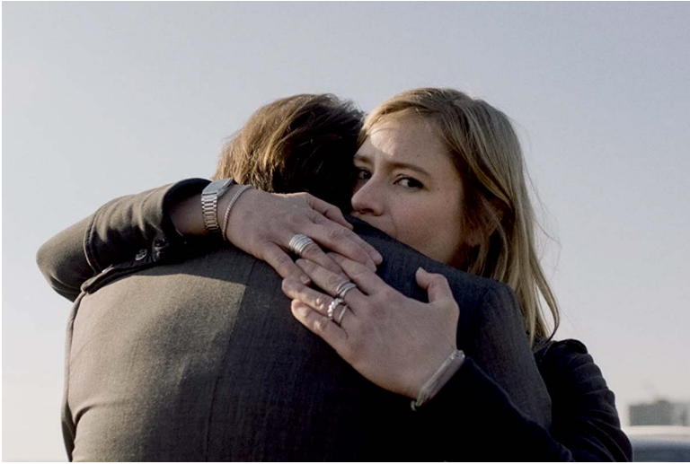
Still from 24 Wochen.