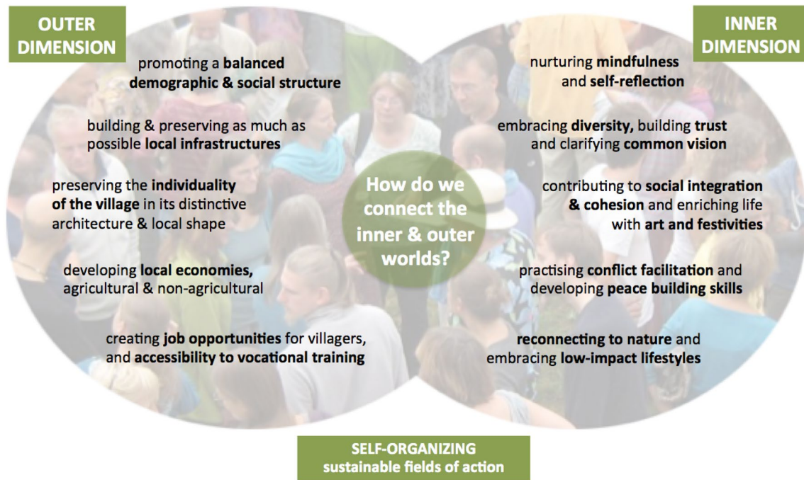
Fig. 2 Connecting inner and outer sustainable fields of self-organized action—the case of ecovillages, (S. Veciana for the conference Leverage Points 2019, Lüneburg)

process of developing a new sustainable lifestyle. To overcome inner barriers and foster agency, ecovillagers actively learn through different individual and collective methods to express themselves in group processes regarding any social, ecological, economical or cultural matter (Veciana and Ottmar 2018). The resultant creative engagement of self-empowered individuals reportedly shapes the group processes, together with a willingness to focus on achieving the ‘best solution for the whole’.