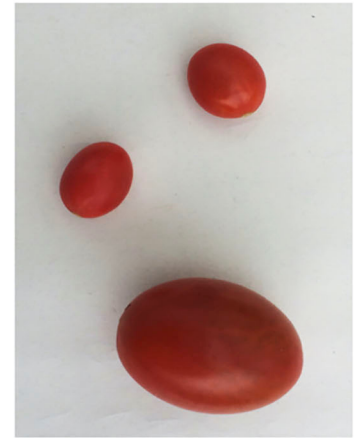
Too small fruits