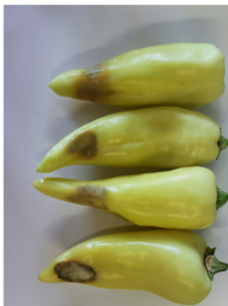
Apical-blossom end rot and sunburn