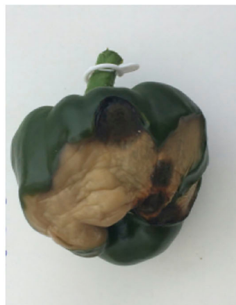
Apical-blossom end rot and Botrytis