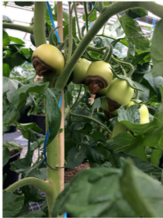
Apical-blossom end rot