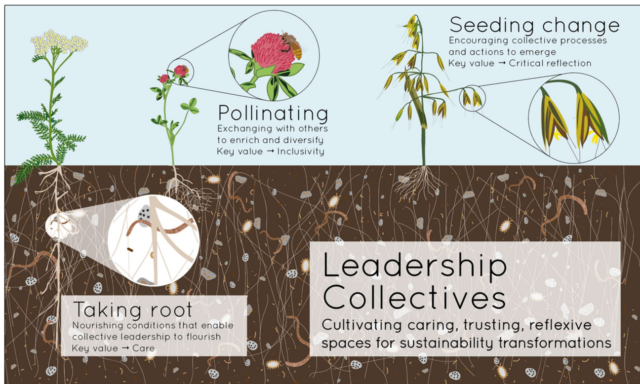
Fig. 1 A metaphorical representation of leadership collectives. Analogous to healthy agro-ecosystems, leadership collectives require nourishing conditions (taking root), exchanging with others to enrich and diversify (Pollinating), and encouraging collective processes and

action to expand (Seeding change), to cultivate caring, trusting and reflexive spaces for sustainability transformations. (Figure by: Veronica Remmele)