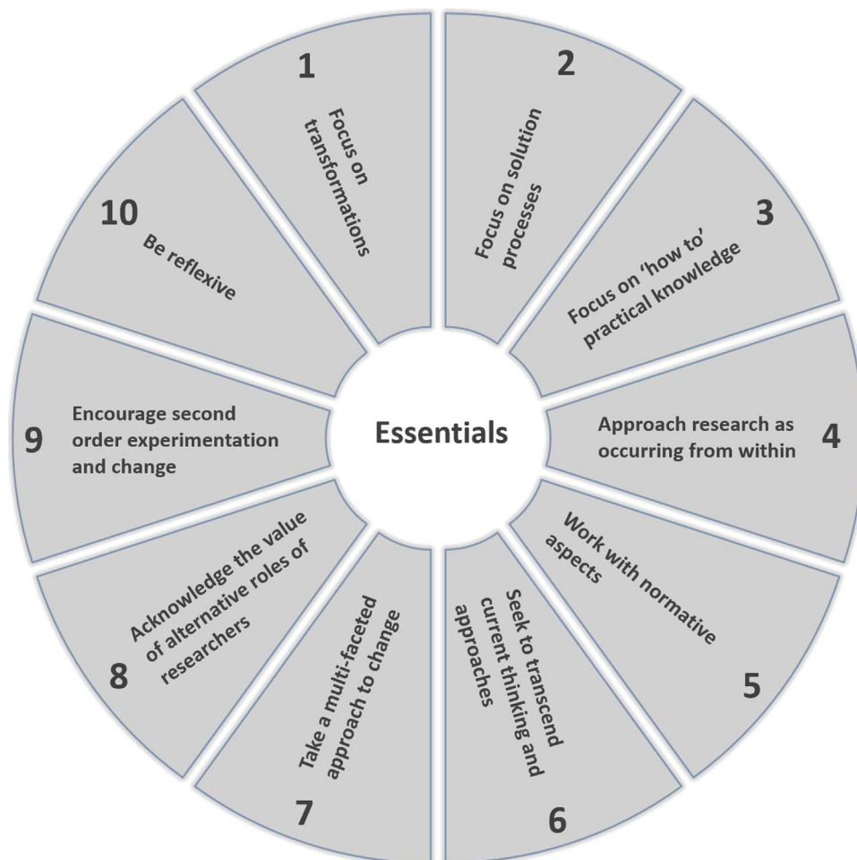
Fig. 1. Ten essentials for second-order transformation research.

The process led to the essentials outlined below. The primary intention is to highlight critical assumptions and outline what is needed for a comprehensive approach to second-order transformation research rather than prescribe how to apply the essentials in practice. Nevertheless, many examples and references are also provided about their application. The first three essentials generally relate to the focus