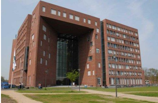
Forum, Building 102 Droevendaalsesteeg 2 6708 PB Wageningen