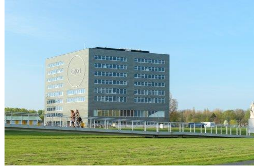
Orion, Building 103 Bronland 1 6708 WH Wageningen