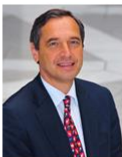
Federal Institute for Vocational Education and Training (BIBB), Bonn, Germany, Deputy President and Head of the Research Thursday, October 20, 11:00-12:00hrs