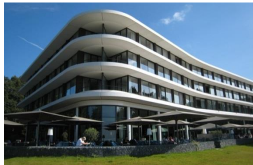
Hotel de Wageningsche Berg Generaal Foulkesweg 96 6703 DS Wageningen