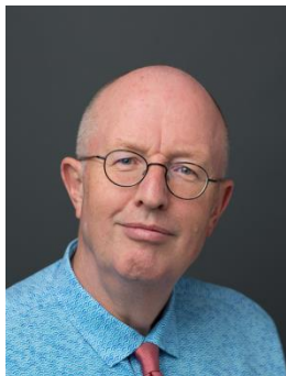
Korn Ferry HayGroup, Amsterdam, The Netherlands Senior Consultant HR Wednesday, October 19, 13:15-14:15hrs