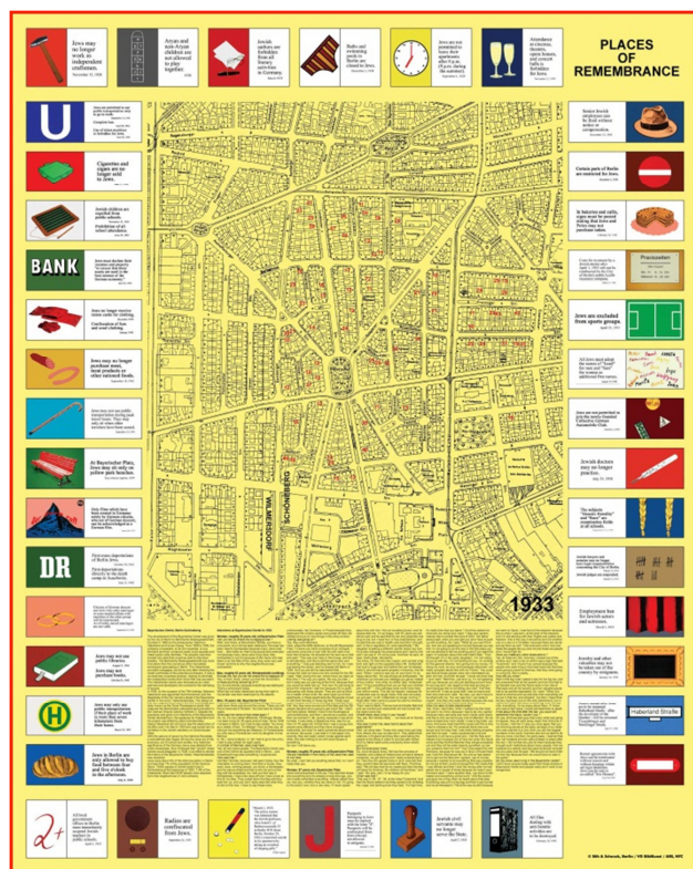
(c) Stih & Schnock, Berlin / VG Bild-Kunst, Bonn / ARS, NYC

The students were sorting through the materials, discussing the decrees, the emerging timeline towards deportation and murder displayed by the dates specified in the texts. The following assignment was used to organize this task: