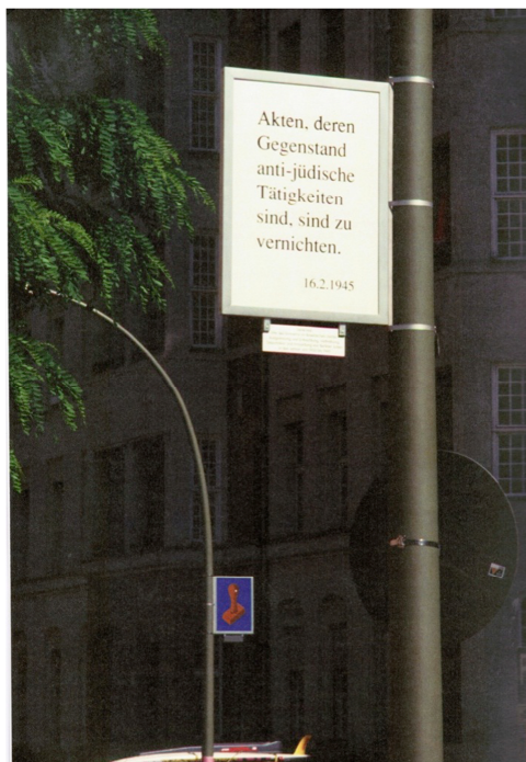
The inscription back reads (translated): „Files covering anti-Jewish activities are to be destroyed. 16.02.1945

Linking these perspectives allows to extend the concept of agency, focusing on the independent examination of historical and political narratives (cf. KMK, 2014) and the ability to take part in their constant and contested rewriting.