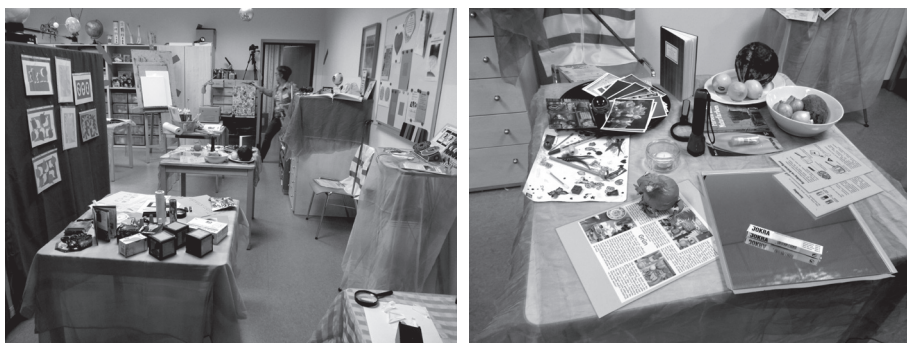
FIGURE 1 – SCENERY WITH MATERIALS IN THE LERNWERKSTATT «LIGHT AND COLOUR»

Prescribed topics are, for example, light and colour, water, insects etc. (figure 1). Together with the coaches the students find a question, plan and conduct experiments and document their ideas and observations in a lab journal. Coaches are the Lernwerkstatt teachers, the classroom teachers who join the Lernwerkstatt , higher education students or assistant teachers. At the end a festivity is arranged by the students to present their own results (Minnerop-Haeler, 2013).