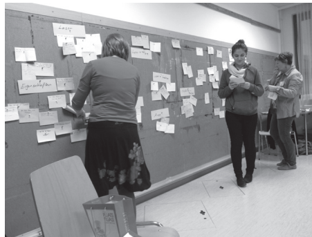
FIGURE 2 – CLUSTERING OF STUDENTS' QUESTIONS

Two video scenes were chosen for this meeting recording the beginning of the Lernwerkstatt where students are supposed to find their research question. The topic was light and colour in grade eight who had Lernwerkstatt for the third time. 20 students of one class participated in this Lernwerkstatt , ten boys and ten girls. Five students officially had special needs, three girls and two boys, reaching from severe to mild disabilities, from mental retardation to autism to ADHD and emotional/behavioural issues. But there are more students with special needs although not diagnosed. According to the teachers every student has particular learning needs. Four coaches were present to support the students: the two leading teachers, the classroom teacher and a school assistant. The researcher and her diploma student were also fixed with scaffolding two groups of students. Every coach except the diploma student knew the class from other lessons to a different extent. One of the leading teachers is the science teacher in this class.