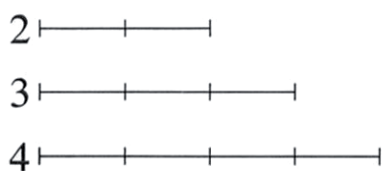
Figure 1: Three line segments visualizing harmonic relations by arithmetic proportionality. 27

This is precisely the concern of René Descartes' (1596–1650) first completed work, Compendium Musicae (1618), an introduction to music theory, where he summarizes the state of diatonic musical thinking in the 16th century; it was not published until 1650 though. 25 Here Descartes wants to understand and determine more precisely the emotional and aesthetic effect of the sensual tonality of music on humans. For this purpose, he includes a variety of diagrams depicting acoustic features. Please note that the subject of Descartes' investigation remains music as a sound event. The visualization serves to understand and demonstrate why we experience music as an acoustic phenomenon the way we do. One example is intervals, which are experienced by listeners as either harmonious or dissonant. Descartes is searching for the underlying cause of this distinction in the auditory impression. To this end, he visualizes tones as graphic line ratios and examines their relations. In doing so he introduces and debates the distinction between proportional and non-proportional line ratios. 26 His thesis is that harmonious sounding intervals can be reconstructed according to the principle of arithmetic proportionality, while disharmonious intervals have a line ratio that is incommensurable: These lines do not share even the smallest common feature, and therefore their relation cannot be expressed as a simple numerical ratio.